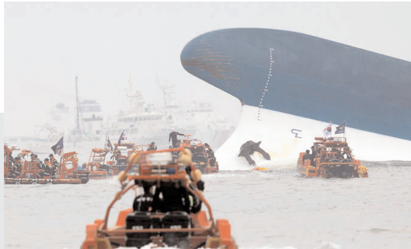
Almost 300 people are missing of the 459 on board the "Sewol," the South Korean government said, with three confirmed dead.